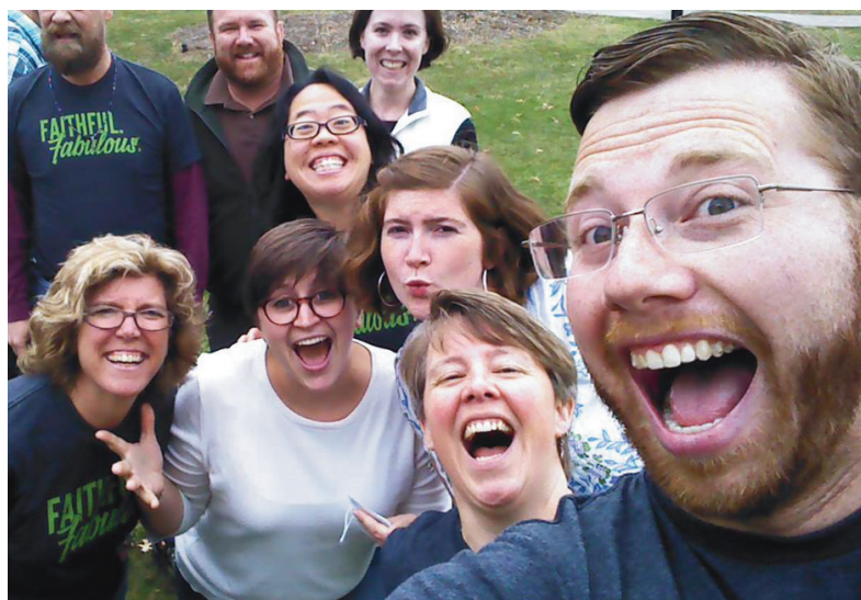
Proclaim Rostered Leaders and Seminarians at the 2014 Retreat.