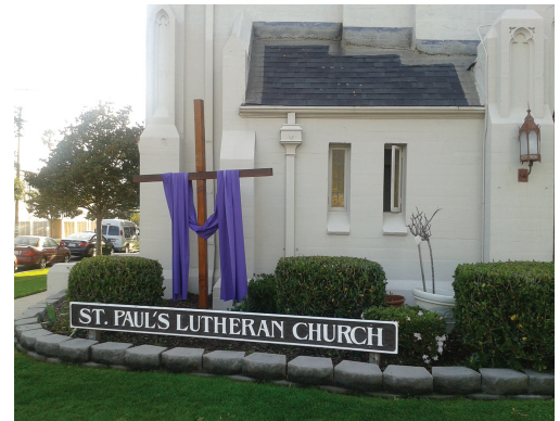
St. Paul's Lutheran Church, Santa Monica, CA