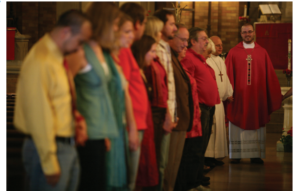
Worship at St. Luke's Lutheran Church of Logan Square

St. Luke's is a congregation in redevelopment on the northwest side of Chicago in a rapidly gentrifying neighborhood. This support grant assists St. Luke's continued redevelopment, expansion and a path to self-sustainability. This is the 5th grant ELM has given St. Luke's as part of our commitment to this redeveloping congregation. In cooperation with St. Luke's, ELM has decreased the grant amount each year as St. Luke's has worked to increase their sustainability.